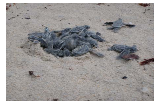
Photo 2 Turtle watching and conservation support small businesses in some rural communities.