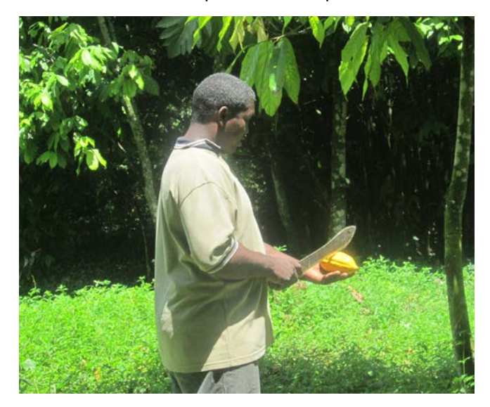
Photo 1 Community member tests the cocoa before harvesting for the small business that the group is involved in.

There is a range of government and private financing mechanisms for SMMEs but few that address the challenge of no or low collateral; so in effect they are often not accessible to start-up micro-entrepreneurs.