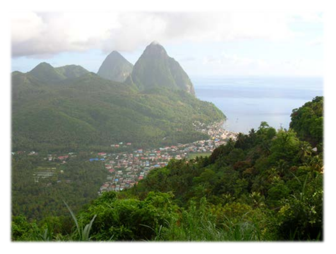
Photo 1 The iconic Pitons attract tourism investment that needs to also bring socio-economic benefits to the town of Soufriere and wider Saint Lucia while ensuring that the ecological integrity of the World Heritage Site is maintained.

environmental concerns. These have implications for the cost of doing business in Saint Lucia given the high operating cost in