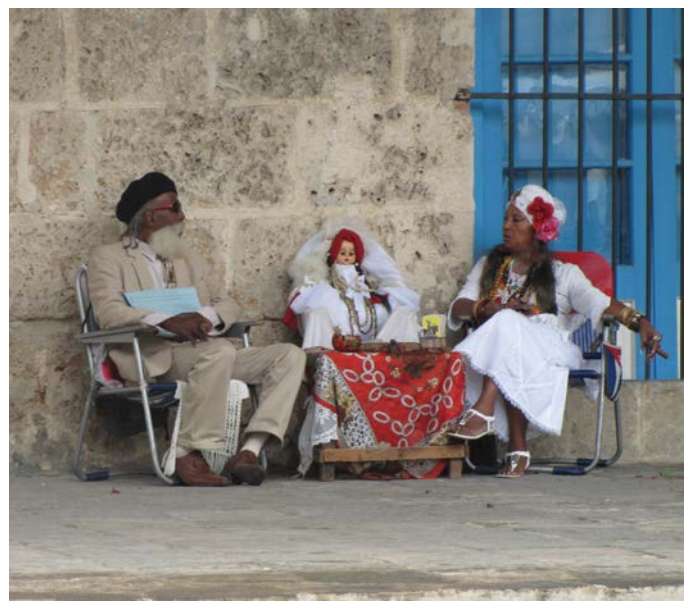
Photo 1. Entrepreneurs in downtown Havana tourist areas.

Many of these initiatives provide examples of the social and environmental benefits that