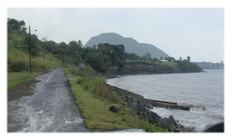
Photo 1 The impacts of climate change are already evident across the Caribbean islands as rising sea levels and bigger storm waves mean that we are losing our beaches and seaside roads are under threat.

There is an unequal exchange of human resources, with the outflow of young educated and skilled persons being matched by the return of deportees and retirees. These inflows present challenges to the government to reform and enhance social security and safety nets .