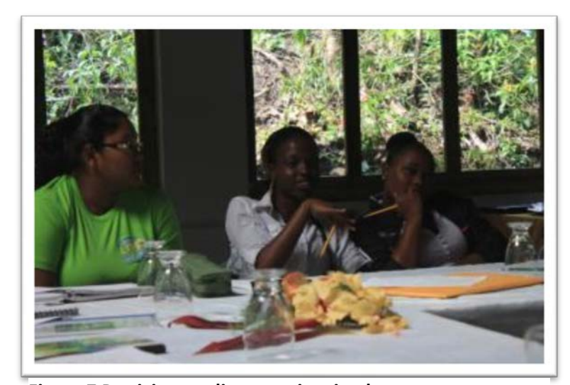
Figure 7 Participants discuss points in plenary

The facilitator explained that the advertising industry uses communication a lot. In the car advertisement scenario, she explained, the advertisements consistently share the same message.