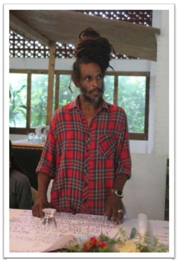
Figure 2 Participant from Brasso Seco shares information about his group