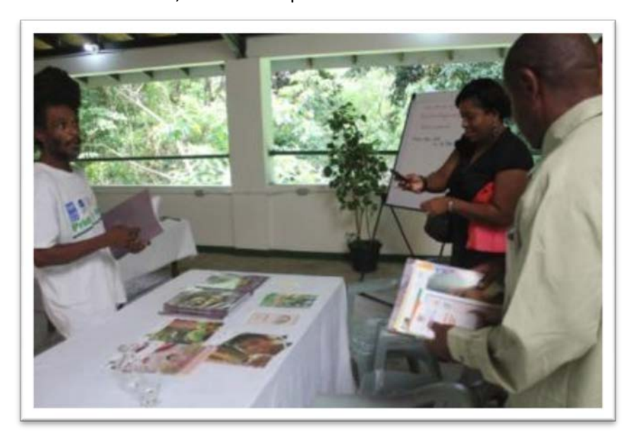
Figure 6 Communities interact with IICA representative

The participants were asked to draw faces to describe how they felt at the end of the workshop. The faces described their feelings. They were asked to discuss their drawings in plenary. After this evaluation exercise, the workshop was closed.