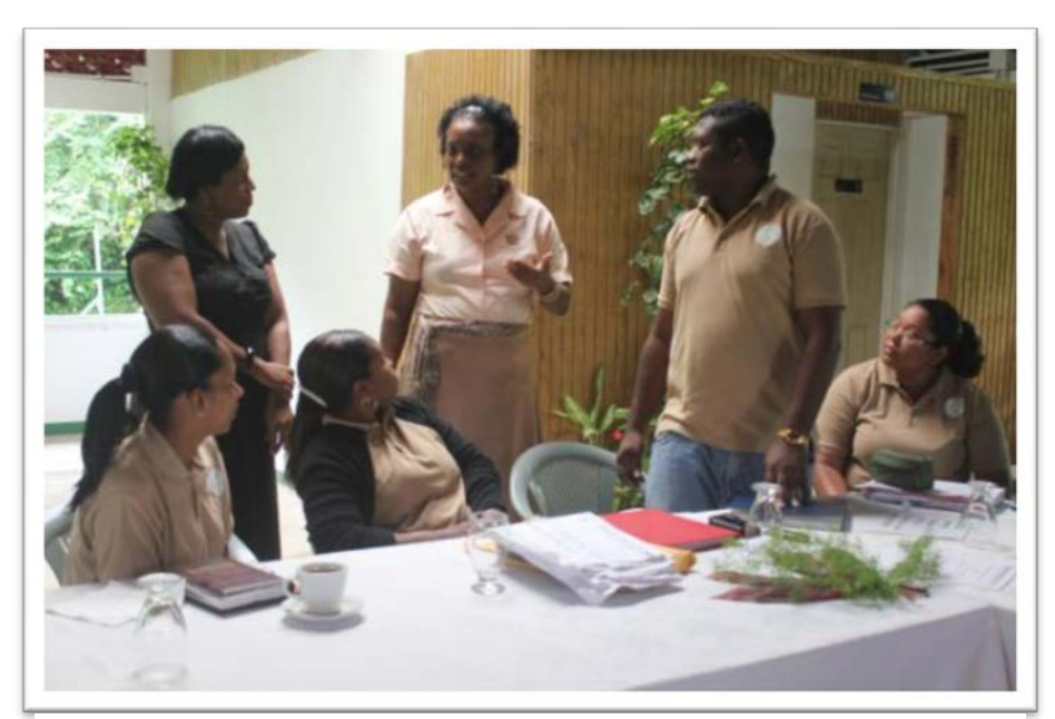
Figure 9 AYDO representatives discuss the possibility of funding their recipe book with Community Development Division

The communities and agencies discussed the presentations and came up with effective means of communication with each other. The support agencies asked for assistance to effectively support rural communities. The tips for communicating between the two groups are shown in Appendix 4. The support agencies also shared information on some of the services they offered. These are shown in Appendix 5.