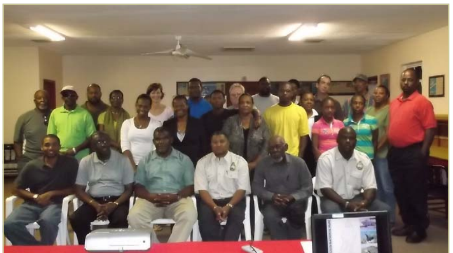
Group photograph taken at one of the public meetings