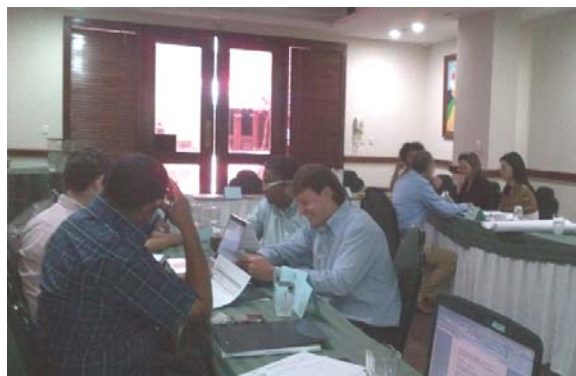
Participants of the conservation agreements workshop in the Dominican Republic