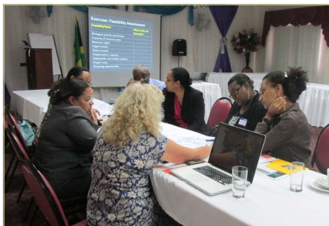
Participants of the conservation agreements workshop in Jamaica