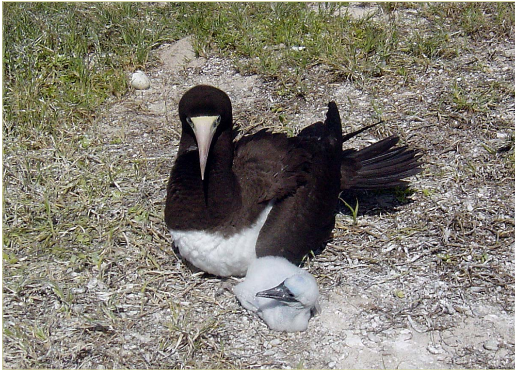
The Brown Boobie and chick at Graham's Harbour, the Bahamas