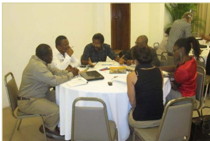
Participants of the conservation agreements workshop in Haiti