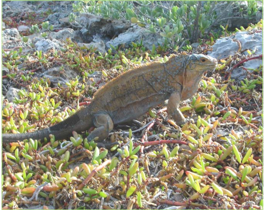
The San Salvador rock iguana