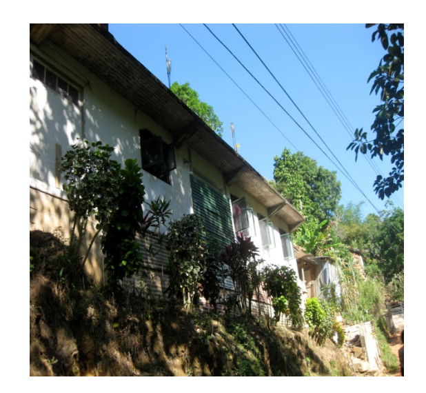
Community and project transect walks