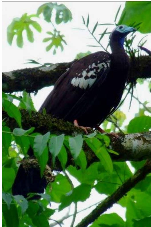
Figure 1: Adult Trinidad Piping-guan

Species: Pipile pipile (Trinidad Piping-guan)