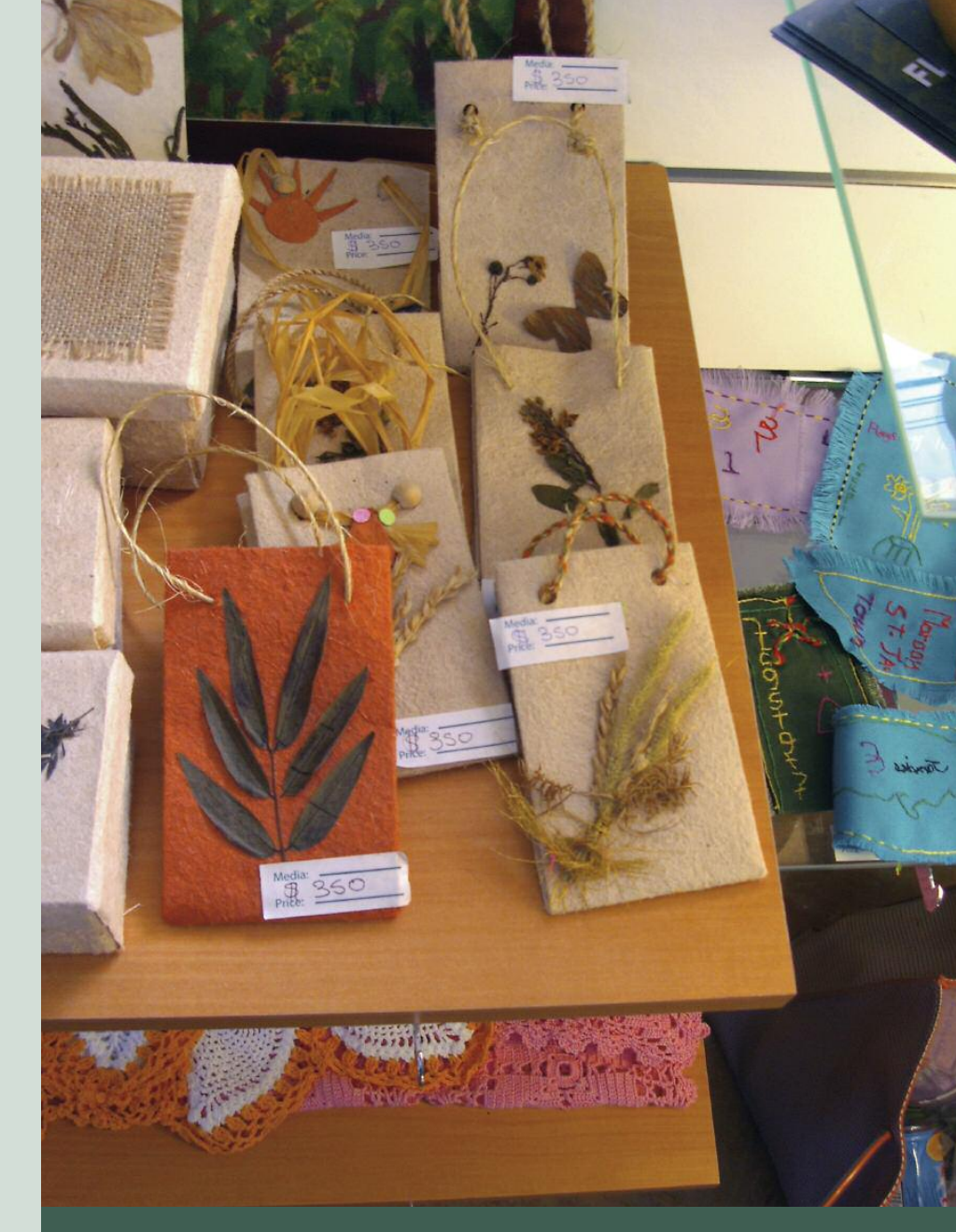
Cockpit Country Local Forest Management Committee

The Maroon Community Group in Nevis educates people about how the maroons used the forest resources as an important part of Caribbean heritage.