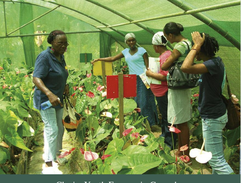
Clozier Youth Farmers in Grenada

People in rural communities who are involved in managing forests are getting many benefits that are improving their livelihoods, or quality of life. Benefits are seen in improved "assets" in several areas: