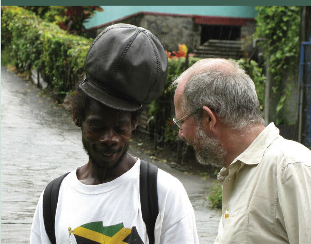
Keepers of the Environment member speaking directly with representative of an international organization