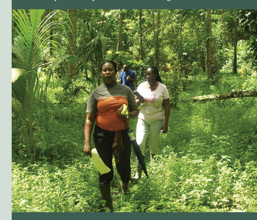
National Reforestation and Watershed Rehabilitation Programme community group in Argyle