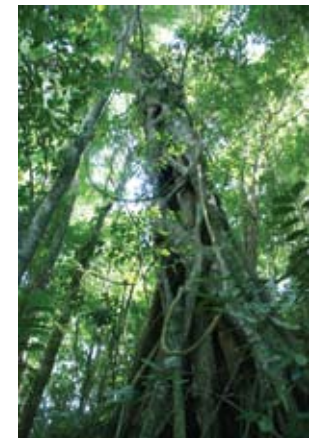
A strangler - an interpretive feature along the trail route.