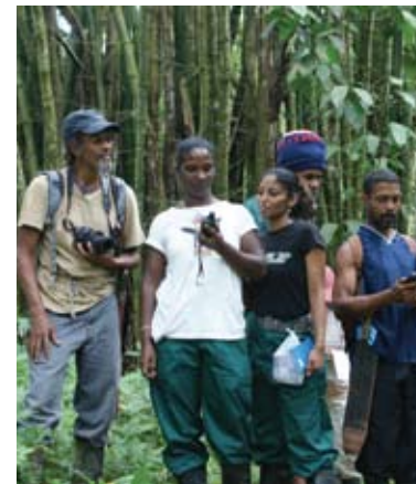
The group waits on the estimated accuracy from their GPS receivers.

The group started collection of way point data along an existing benching, they propose to use as a trail route. Approximately five hours were spent in the field.